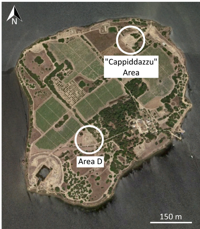
Fig. 2 - The excavation areas taken in consideration in this study: “Cappiddazzu” Area and Area D.

In terms of anthracological remains, a total of 26 taxa was identified (Tab. 1). Out of these, 11 were only found in F.1112, and 6 were only retrieved in the votive pits. Taking into consideration all wood remains, Olea europaea L. (olive) was the most represented, with a total of 408 fragments attributed to this species. This was followed by Quercus evergreen (evergreen oaks; 240 fragments) – most common in the disposal pit, and Pistacia lentiscus L. (lentisk; 201 fragments), the prevalent species in F.7012.